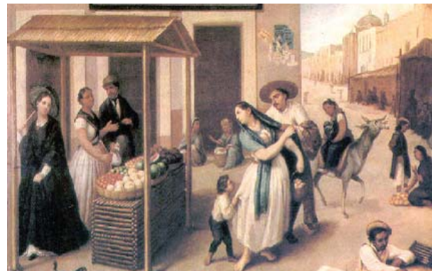
Paintings from Colonial Mexico; notice how race and social status are reflected in the paintings by clothing and skin color.

Spanish and Indian elements, as well as some Moorish, African and non-Spanish European influences.