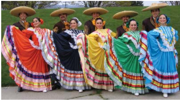
Above: Colonial drawing of a couple dancing zapateado. Below: Modern day people from Jalisco wearing the traditional outfits for dancing the jarabe tapatío .